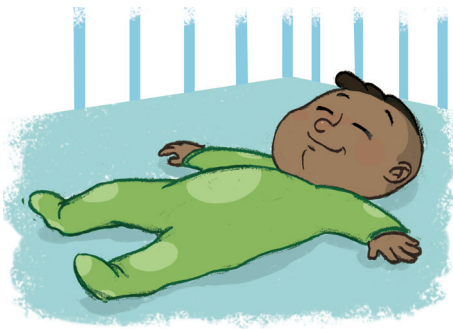
... rest afterwards