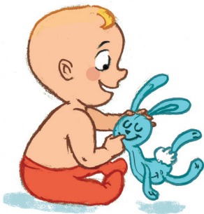
... grab things and play with them