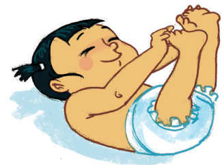
... discover my body