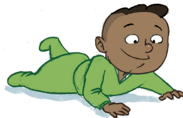
... Learn to control my posture and movements